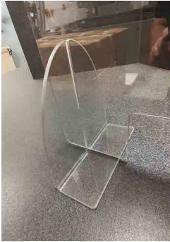
Optional bent foot